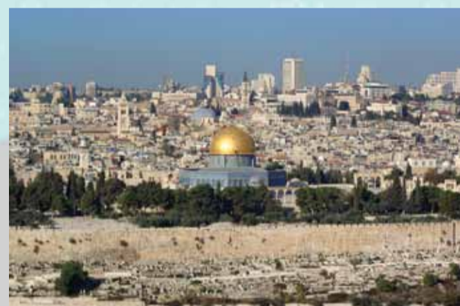
AKKA (1x30') JAFFA (1x30') JERUSALEM (2x30')

The works produced during Ottoman-Turkish hegemony for 400 years in Akka, Jaffa and Jerusalem which were a former Ottoman sanjak and is now located in palestine under israel hegemony, are introduced with this documentary. In the programme; history of the cities, military and strategical